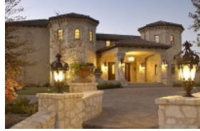
Homes Of The World's Most Powerful Celebrities