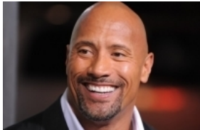
The Rock is Kicking Ass and Saving Franchises