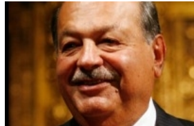
Forbes Real-Time Billionaires