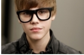
Justin Bieber, Venture Capitalist: The Forbes Cover Story