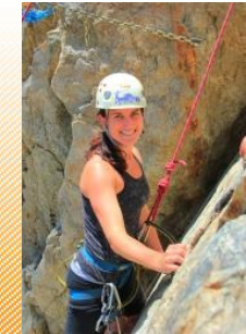
goose_lightning: Women seeking Men