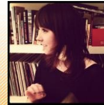
libby1: Women Seeking Men