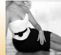
Down the Rabbit Hole