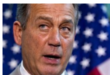
Fast and Furious: Failed scandal