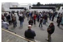
What's really happened to America's soldiers