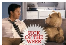
Pick of the week: Mark Wahlberg and his foulmouthed teddy bear