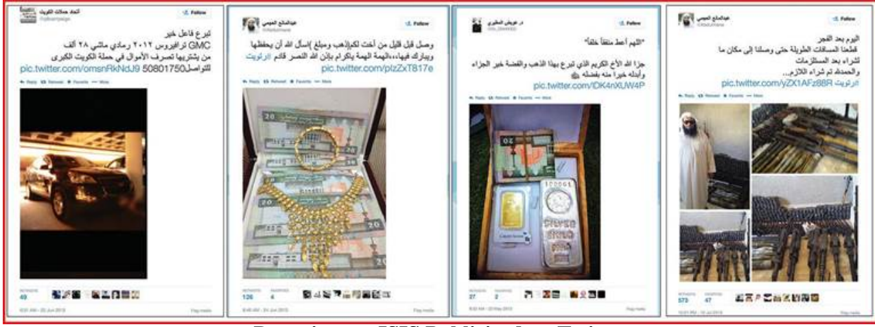
Donations to ISIS Publicized on Twitter