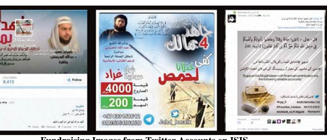
Fundraising Images from Twitter Accounts on ISIS