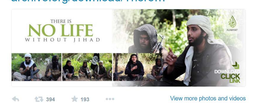
Tweet by Al-Hayat Media Center Account @alhayaten Promoting an ISIS Recruitment Video