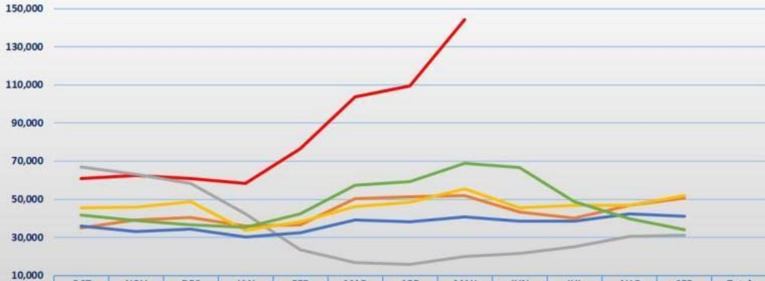
CBP Southwest Border Total Apprehensions / Inadmissibles