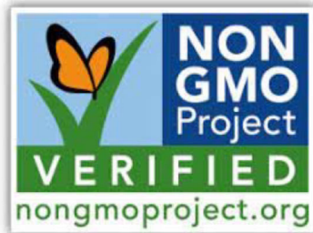
Non-GMO Project's Verified Seal