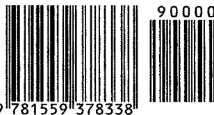
Exhibit 3 Page 15