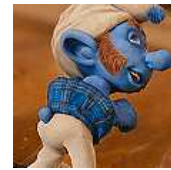
Box Office Cowboys & Aliens gets Smurfed