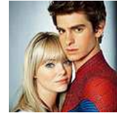
Amazing Spider-Man 6 new pics of the suit, Peter, and Gwen!