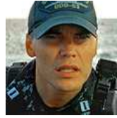
Battleship Trailer: Taylor Kitsch in high seas action