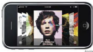
The interface features "cover flow" technology for flipping through album covers.

Battery life: Like the iPod, but unlike most cellphones, the iPhone lacks a removable battery. So you can't carry a spare. But its battery life is excellent. In our tests, it got seven hours and 18 minutes of continuous talk time, while the Wi-Fi was on and email was constantly being fetched in the background. That's close to Apple's claim of a maximum of eight hours, and far exceeds the talk time claims of other smart phones, which usually top out at five and a half hours.