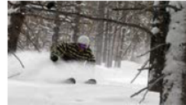
Water Fight Hits the Slopes