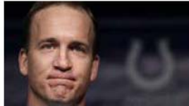
Manning Leaves Colts