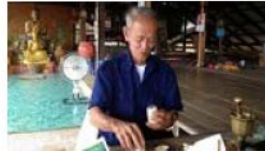
In Thailand, It's Hard to Predict Future of Fortunetelling