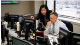
Fund Boss Starts Over (Yet Again)