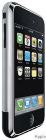
The phone is thinner than many smart phones.

It feels solid and comfortable in the hand and the way it displays photos, videos and Web pages on its gorgeous screen makes other smart phones look primitive.