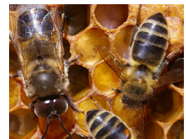
Honeybees Choose Their Jobs Depending On Their Personalities