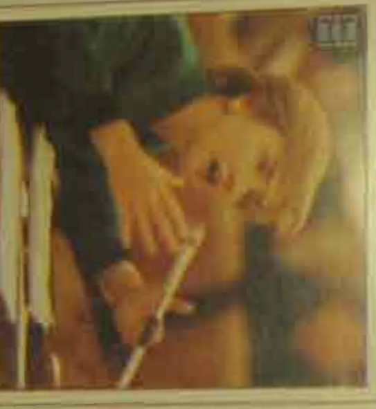
WASHINGTON — First lady Hillary Rodham Clinton, testifies before the House Ways and Means Committee, yesterday afternoon. Mrs. Clinton asked members of Congress to work with the administration to overhaul the nation's aging health care system.

ORLANDO, Fla. — The roar of the engines startled commuters into flight as space shuttle Endeavour clears the launch pad in background during early hours of Thursday morning.