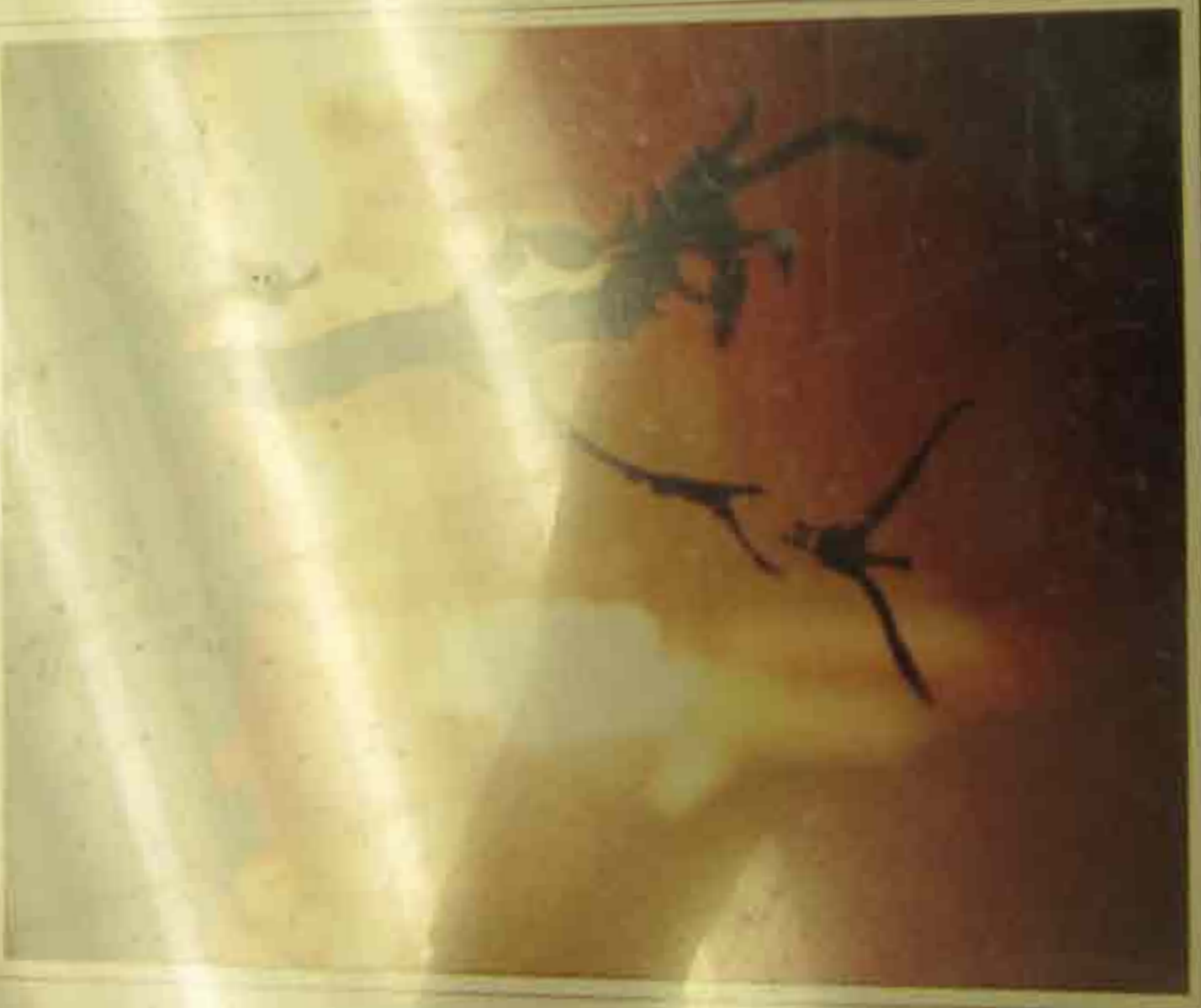
Shuttle launch lights morning skies

WASHINGTON — An impatient United Nations Security Council has demanded that Iraq comply "fully and unconditionally" with terms of the Persian Gulf War cease-fire resolution by March 21, or face serious but unspecified consequences. As usual, it is unclear what Saddam intends to do. Deputy Prime Minister Tariq Aziz was at first defiant but later he seemed to be seeking a way to back down as Iraq has done several times before.