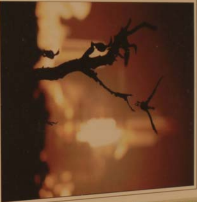
Shuttle launch lights morning skies CAPE CANAVERAL, Fla. — The roar of the engines stirs the moments into flight as space shuttle Endeavour clears the launch pad in background during early hours of Thursday morning.

WASHINGTON — An impatient United Nations Security Council has demanded that Iraq comply "fully and unconditionally" with the terms of the Persian Gulf War ceasefire resolutions by March 21, or face serious but unspecified consequences. As a result, it is unclear what Saddam intends to do. Deputy Prime Minister Tariq Aziz was at first defiant but later he seemed to be seeking a way to back down as Iraq has done several times before.