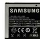
Galaxy S Standard Battery (1500mAh) EB575152VABSTD