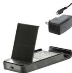
Galaxy Spare Battery and Charging System 1500 mAh ET-CHGPKNVGSTA