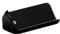
Galaxy S i897 Desktop Dock & Wall Charger ECR-D981BEGSTA