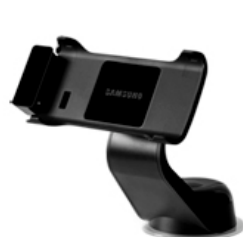
Galaxy S i897 Vehicle Navigation Mount ECS-M981BEGSTA