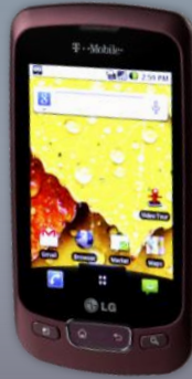
LG Optimus 2010