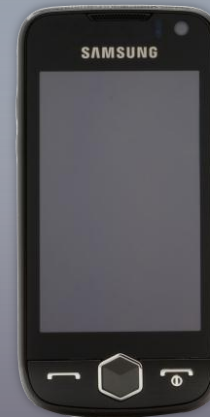
Jet S8000 Jun. 2009