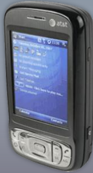
ATT Tilt Sep. 2007