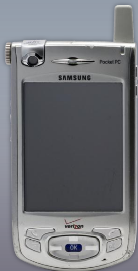
i700 Mar. 2004