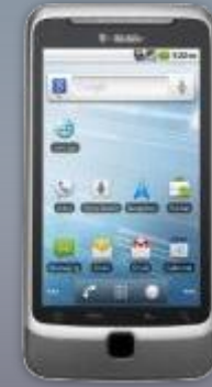
T-Mobile G2 Nov. 2010