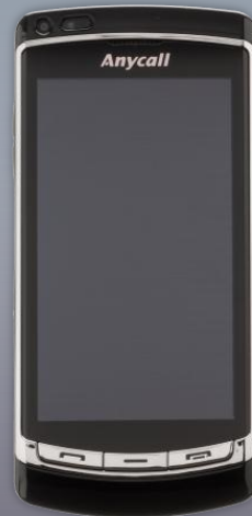
i8910 Omnia HD May 2009