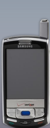
i730 Jul. 2005