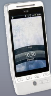
HTC Hero 2009