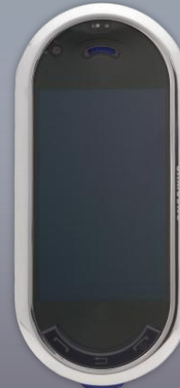
M7600 Beat DJ May 2009