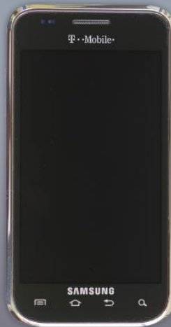
Vibrant T959 Jul. 2010