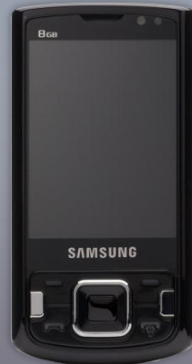
i8510 INNOV8 Sep. 2008