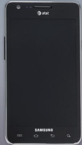
Galaxy S II SGH-I777 Oct. 2011