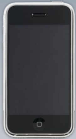
APPLE iPHONE ANNOUNCED