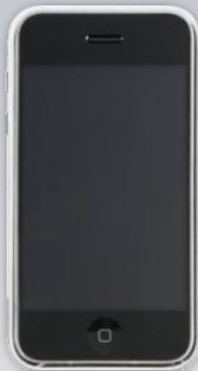
iPhone Jun. 2007