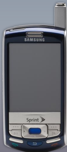
i830 Jan. 2006