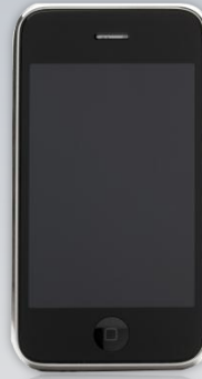
iPhone 3G Jul. 2008