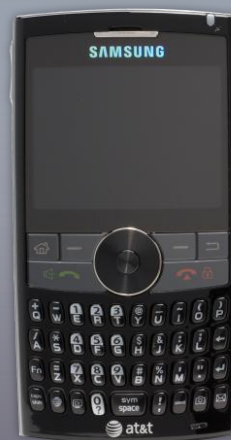
Blackjack i607 Nov. 2006