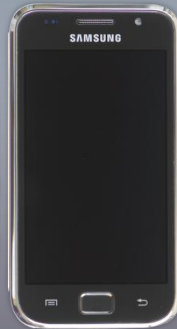
Galaxy S i9000 Jun. 2010