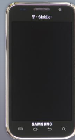
Galaxy S 4G T959V Feb. 2011