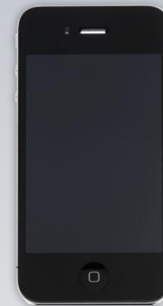
iPhone 4 Jun. 2010