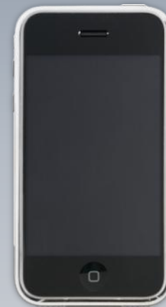
APPLE IPHONE ANNOUNCED