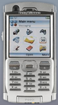
Sony Ericsson P990i Aug. 2006