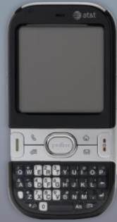
Palm Centro Oct. 2007