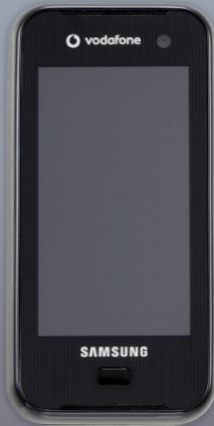
F700 Dec. 2007