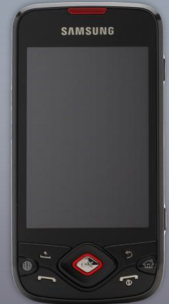
i5700 Galaxy Spica Nov. 2009