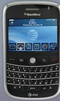
BlackBerry Bold 2008