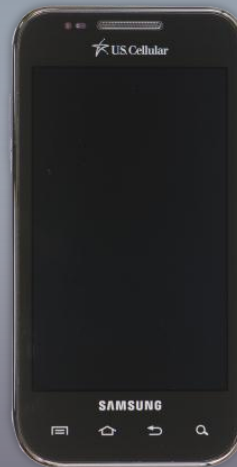
Mesmerize i500 Oct. 2010