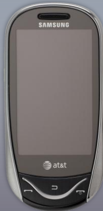
Sunburst Mar. 2010