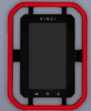
Aug. 2011 Vinci Tablet