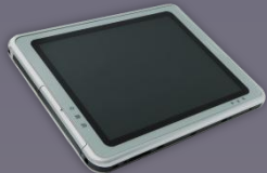
Nov. 2002 Compaq TC1000