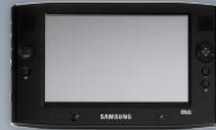
May 2006 Samsung Q1