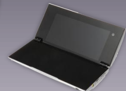
Nov. 2011 Sony Tablet P