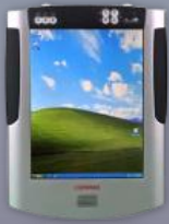
2001 Compaq Tablet