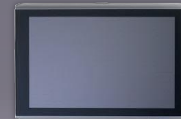
Apr. 2011 Acer Iconia A500