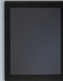
Mar. 2011 Apple iPad 2