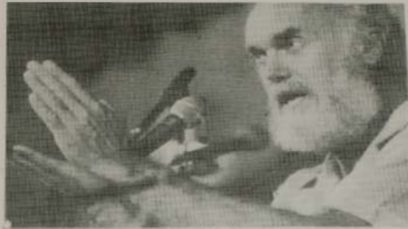
Julian Bond, Democrat's 2000 presidential candidate.

MEXICO CITY (AP) — During 1978, the Federal Reserve Bank of Miami had a $5 billion cash surplus, the largest in the nation. Treasury officials estimate that during that year, smugglers laundered more than $100 million through Miami banks — a figure some authorities say is conservative.