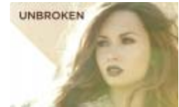
Demi Lovato Re-Rising Star Reveals Album Art [PHOTOS]