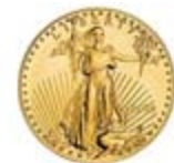
How to make money from gold investment