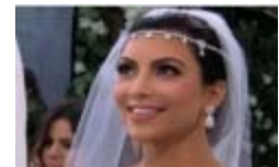
Kim Kardashian Wedding, Stars Tweet Reactions to the Big Day [VIDEO&PHOTOS]