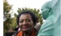
Public Gets a Peek at the Martin Luther King Memorial