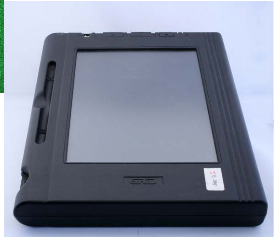
GRIDPAD 2050 SL Announced in 1992