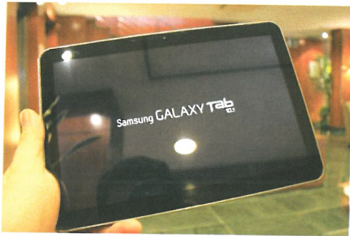
The Android "Honeycomb" unlock screen.