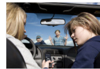
35 Percent of College Students Use Apps While Driving