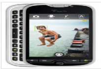
T-Mobile Touts Camera in MyTouch 4G Slide