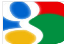
Google Teams Up With the Getty Museum, Gives Art Fans 'Goggles'