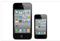
Two New iPhones? Three Reasons It Won't Happen