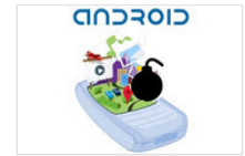
Symantec Compares Apple's iOS and Android Security