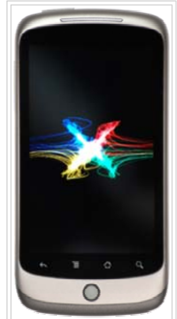
Google's Nexus One was the first smartphone to receive Android 2.2 Froyo.

On May 20, 2010, the Android 2.2 (Froyo) SDK was released, based on Linux kernel 2.6.32. [27]