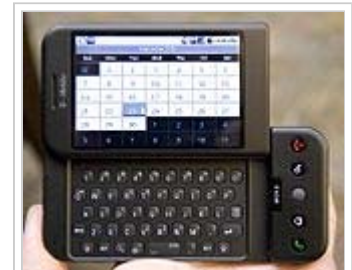
The HTC Dream introduced Android 1.0.

Android 1.0, the first commercial version of the software, was released on September 23, 2008. [6] The first Android device, the HTC Dream, [7] incorporated the following Android 1.0 features: