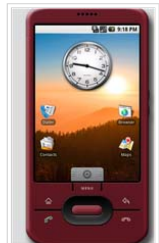
The Android Emulator default home screen (v1.5).

On April 30, 2009, the Android 1.5 update, dubbed Cupcake, was released, based on Linux kernel 2.6.27. [15][16] The update included several new features and UI amendments: [17]