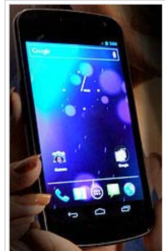
The Samsung Galaxy Nexus, the first of the Samsung Galaxy series to run Android 4.0.

The SDK for Android 4.0.1 (Ice Cream Sandwich), based on Linux kernel 3.0.1, [53] was publicly released on October 19, 2011. [54] Google's Gabe Cohen stated that Android 4.0 was "theoretically compatible" with any Android 2.3.x device in production at that time. [55] The source code for Android 4.0 became available on November 14, 2011. [56] The update introduced numerous new features, including: [57][58][59]