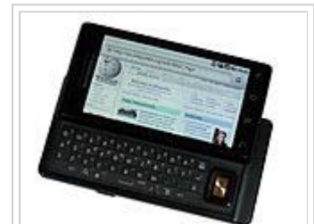
The Motorola Droid, running Android 2.0.

On October 26, 2009, the Android 2.0 SDK – codenamed Éclair – was released, based on Linux kernel 2.6.29. [22] Changes included: [23]