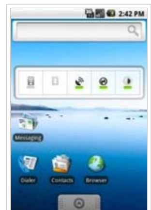
The Android 1.6 home screen.

On September 15, 2009, the Android 1.6 SDK – dubbed Donut – was released, based on Linux kernel 2.6.29. [19][20][21] Included in the update were numerous new features: [19]