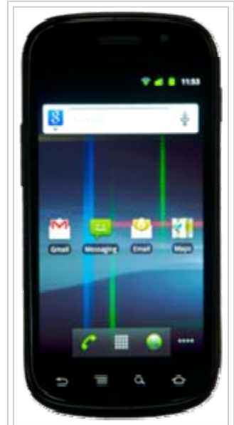
Google's Nexus S introduced Android 2.3 Gingerbread.

On December 6, 2010, the Android 2.3 (Gingerbread) SDK was released, based on Linux kernel 2.6.35. [34][35] Changes included: [34]