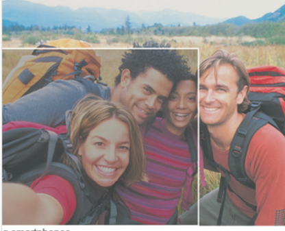
g smartphones Capture twice the picture with the ultra-wide-angle front camera lens.