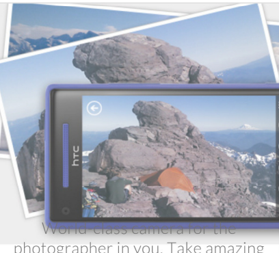
photographer in you. Take amazing photos—even in low light.