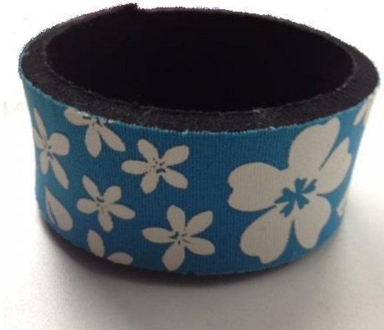
8 9 FIG. 8

10 ( Id. ) The complaint does not provide a description or pictures of the Stem Gemz 11 products.