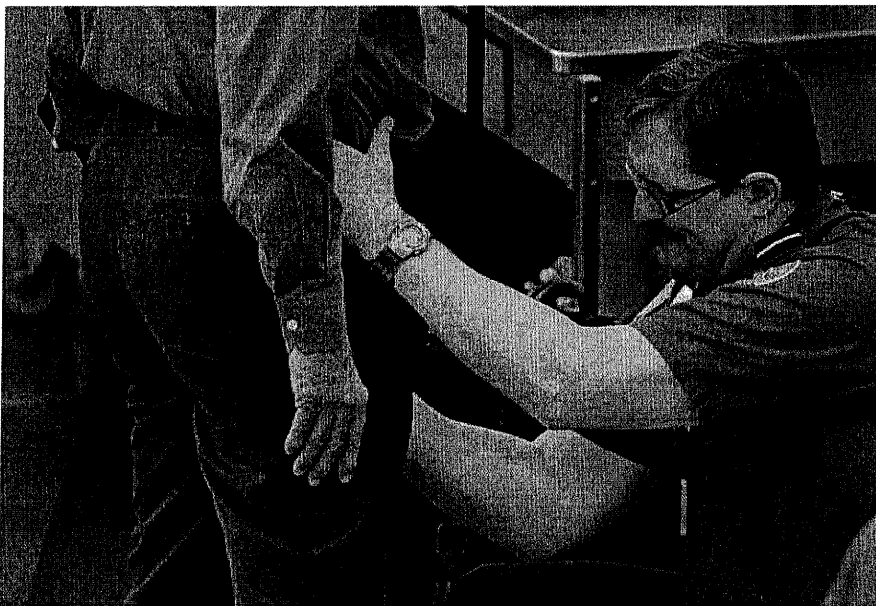
Transportation Security Administration agents perform enhanced pat-downs on passengers at DIA on Wednesday amid growing controversy about the screenings and full-body scanners, one week before Thanksgiving air travelers crowd airports.