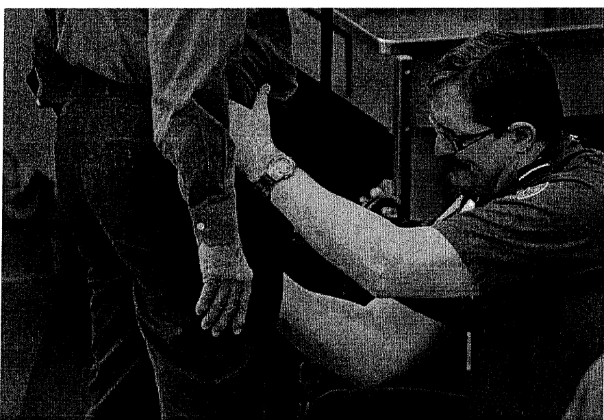
Transportation Security Administration agents perform enhanced pat-downs on passengers at DIA on Wednesday amid growing controversy about the screenings and full-body scanners, one week before Thanksgiving air travelers crowd airports.

Despite ongoing criticism from some Washington lawmakers and many travelers, Transportation Security Administration chief John Pistole refused Wednesday to back off the agency's position that tougher airport screening techniques are needed to counter evolving threats.