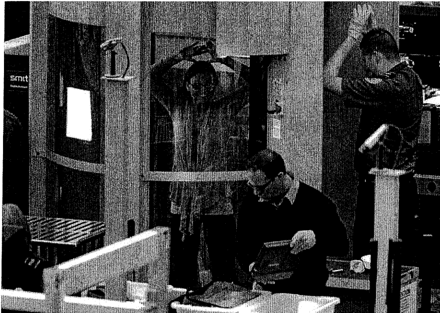
Passengers at Denver International Airport on Wednesday go through a full-body scanner.