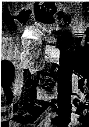
Transportation Security Administration agents perform enhanced pat-downs on passengers at DIA on Wednesday amid growing controversy about the screenings and full-body scanners, one week before Thanksgiving air travelers crowd airports.

Obama asks whether there are less-intrusive options