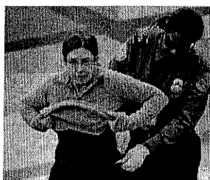
A passenger at Denver International Airport on Wednesday