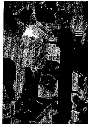
Transportation Security Administration agents perform enhanced pat-downs on passengers at DIA on Wednesday amid growing controversy about the screenings and full-body scanners, one week before Thanksgiving air travelers crowd airports.

Obama asks w hether there are less-intrusive options