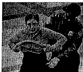
A passenger at Denver International Airport on Wednesday