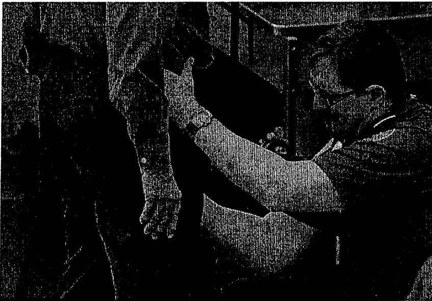
Transportation Security Administration agents perform enhanced pat-downs on passengers at DIA on Wednesday amid growing controversy about the screenings and full-body scanners, one week before Thanksgiving air travelers crowd airports.

689 people recommend this. Be the first of your friends.