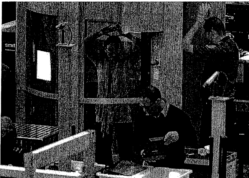
Passengers at Denver International Airport on Wednesday go through a full-body scanner.

The TSA's policy for passengers bringing liquids, gels and aerosols on the plane says travelers can tote such items in containers of 3.4 ounces or less if the items fit in a 1-quart, clear plastic, zip-top bag. Each passenger can travel with one such bag; it must be removed from luggage and placed in the screening bin at the checkpoint, the TSA says. Jeffrey Leib, The Denver Post