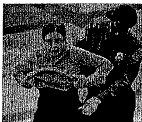
A passenger at Denver International Airport on Wednesday