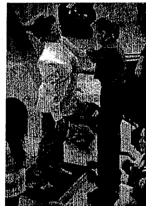
Transportation Security Administration agents perform enhanced pat-downs on passengers at DIA on Wednesday amid growing controversy about the screenings and full-body scanners, one week before Thanksgiving air travelers crowd airports.

Obama asks w whether there are less-intrusive options