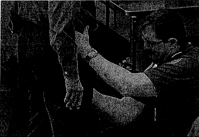
Transportation Security Administration agents perform enhanced pat-downs on passengers at DIA on Wednesday amid growing controversy about the screenings and full-body scanners, one week before Thanksgiving air travelers crowd airports.

Despite ongoing criticism from some Washington lawmakers and many travelers, Transportation Security Administration chief John Pistole refused Wednesday to back off the agency's position that tougher airport screening techniques are needed to counter evolving threats.