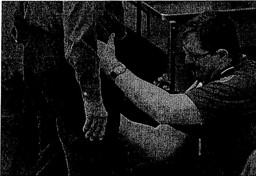
Transportation Security Administration agents perform enhanced pat-downs on passengers at DIA on Wednesday amid growing controversy about the screenings and full-body scanners, one week before Thanksgiving air travelers crowd airports.

Recommend 689 people recommend this. Be the first of your friends.