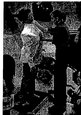
Transportation Security Administration agents perform enhanced pat-downs on passengers at DIA on Wednesday amid growing controversy about the screenings and full-body scanners, one week before Thanksgiving air travelers crowd airports.

Obama asks whether there are less-intrusive options