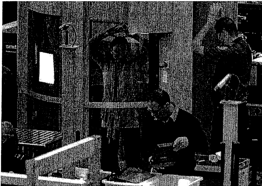
Passengers at Denver International Airport on Wednesday go through a full-body scanner.

The TSA's policy for passengers bringing liquids, gels and aerosols on the plane says travelers can tote such items in containers of 3.4 ounces or less if the items fit in a 1-quart, clear plastic, zip-top bag. Each passenger can travel with one such bag; it must be removed from luggage and placed in the screening bin at the checkpoint, the TSA says. Jeffrey Leib, The Denver Post