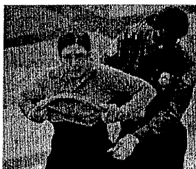
A passenger at Denver International Airport on Wednesday