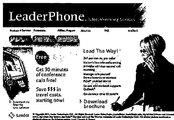
Fig. 1: LeaderPhone™ Teleconferencing Services Home Page