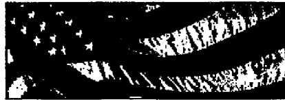
United We Stand

While all of us in the Leader team work tirelessly, we have heavy hearts. Reports are still coming in from our members in the New York and New Jersey areas of family, friends, neighbors, colleagues and acquaintances who died in the tragedy of September 11, 2001. We hear about the recurring nightmares among the children of members who live near Ground Zero. One Leader member lost 5 in his company plus the loss of the 3-year old son of an employee who was a passenger on one of the planes. Another Leader member attended 9 funerals in the span of two weeks – all services for dads who left grieving widows and young children. One Leader Director lost his best friend who worked on the 104 th floor of Tower 1. Yet another Leader Director was a good friend of conservative commentator Barbara Olson, wife of the Solicitor General, who was a passenger on American Flight 77 that crashed into the Pentagon. Unfortunately, we could fill pages relating similar stories.