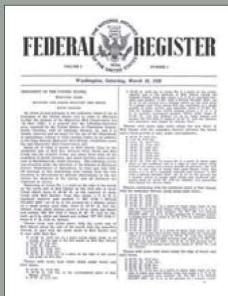
First cover of the Federal Register , March 14, 1936.