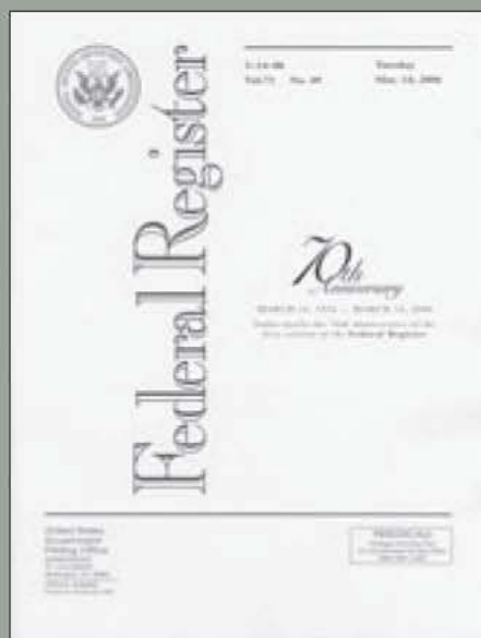
Cover of the Federal Register , March 14, 2006.