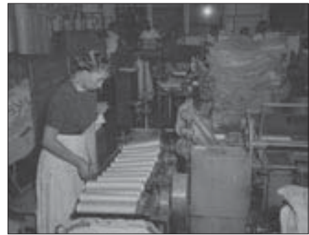
The U.S. Government Printing Office and the Office of the Federal Register are partners in publishing the daily Federal Register . Here a GPO employee operates one of the bindery machines, ca. 1960.

Although the Office of the Federal Register is not often directly involved in litigation, in 1995 and 1996 the Office became entangled in a lawsuit