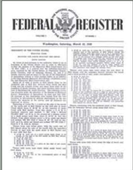
First cover of the Federal Register , March 14, 1936.