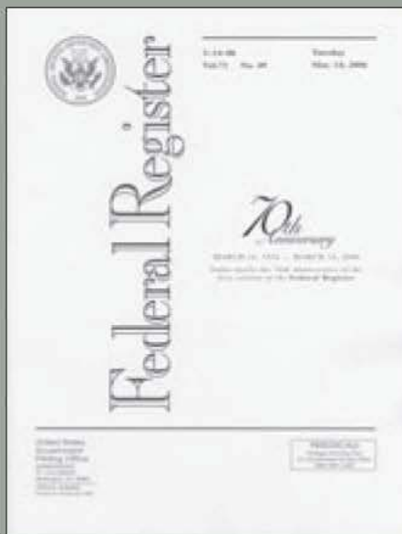
Cover of the Federal Register , March 14, 2006.