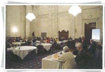
Testing Standards Hill Briefing Photo Gallery (19 Photos)