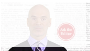
Webster's Dictionary of 1864