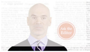
Webster's Dictionary of 1864