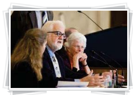
Testing Standards Hill Briefing Photo Gallery (19 Photos)