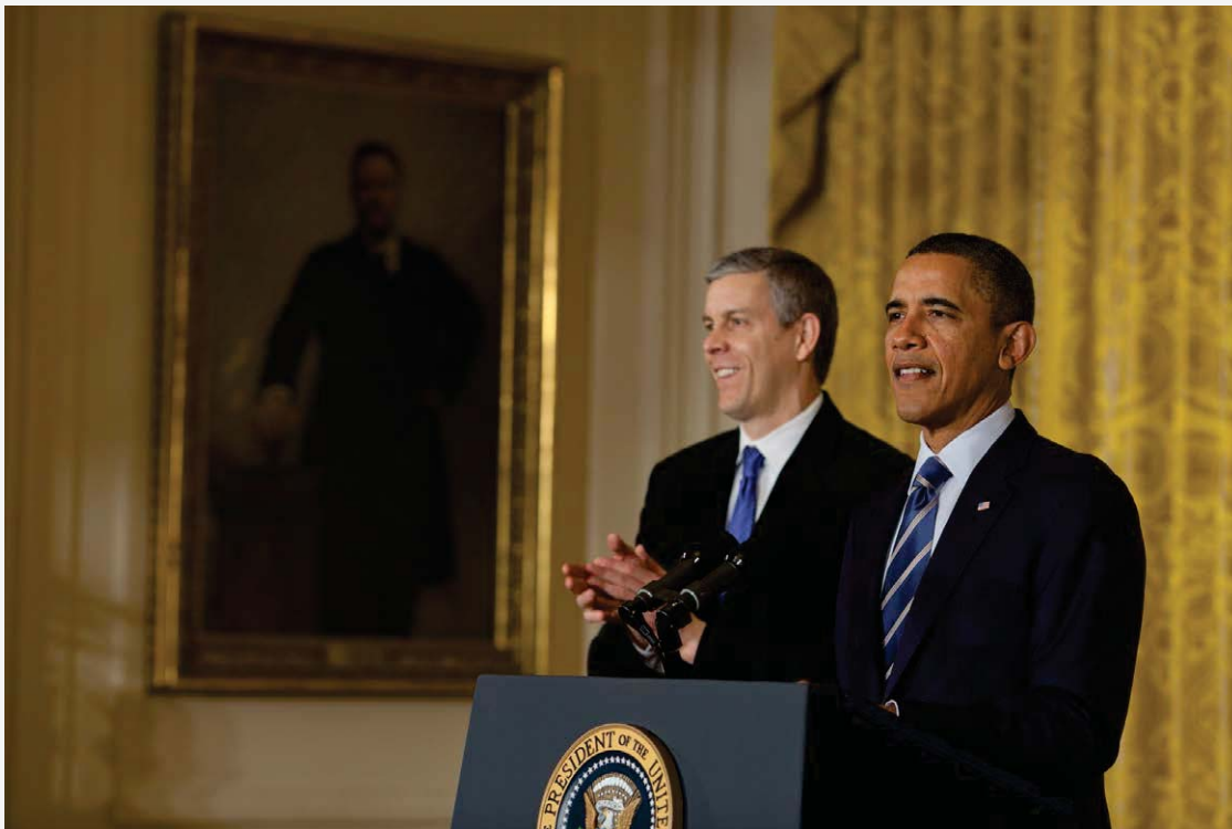
President Barack Obama, with Secretary of Education Arne Duncan, delivers remarks on education reform and the

Summary: We've put together a quick primer to help you understand the details behind President Obama's announcement that 10 states will receive waivers exempting them from meeting No Child Left Behind's most troublesome and restrictive requirements in exchange for setting their own higher, more honest standards for student success.