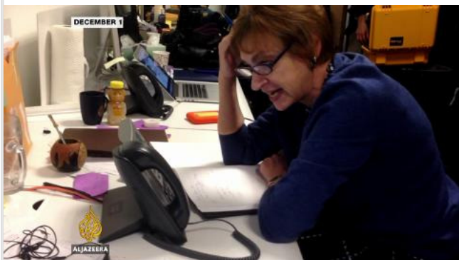
The dark side: Recording backs up Al Jazeera report

The Phillies subsequently issued a statement supporting Howard, calling him "an extremely well-respected member of our team and an outstanding contributor to our community". The team said it will "fully cooperate with any investigation conducted by Major League Baseball and will refer all further questions to them concerning the Al Jazeera report."