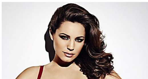
Kelly Brook sizzles in red hot shoot but is she