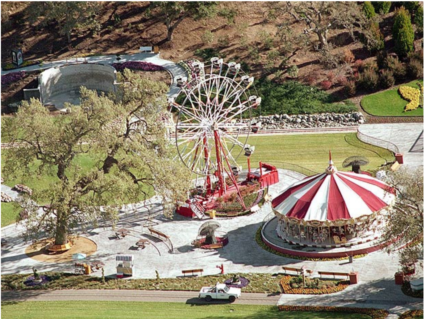
Jackson's Neverland Ranch