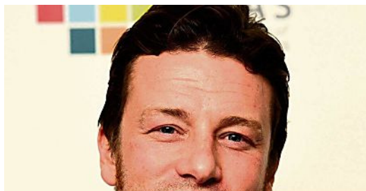
Jamie Oliver I like ladies who don t mind getting