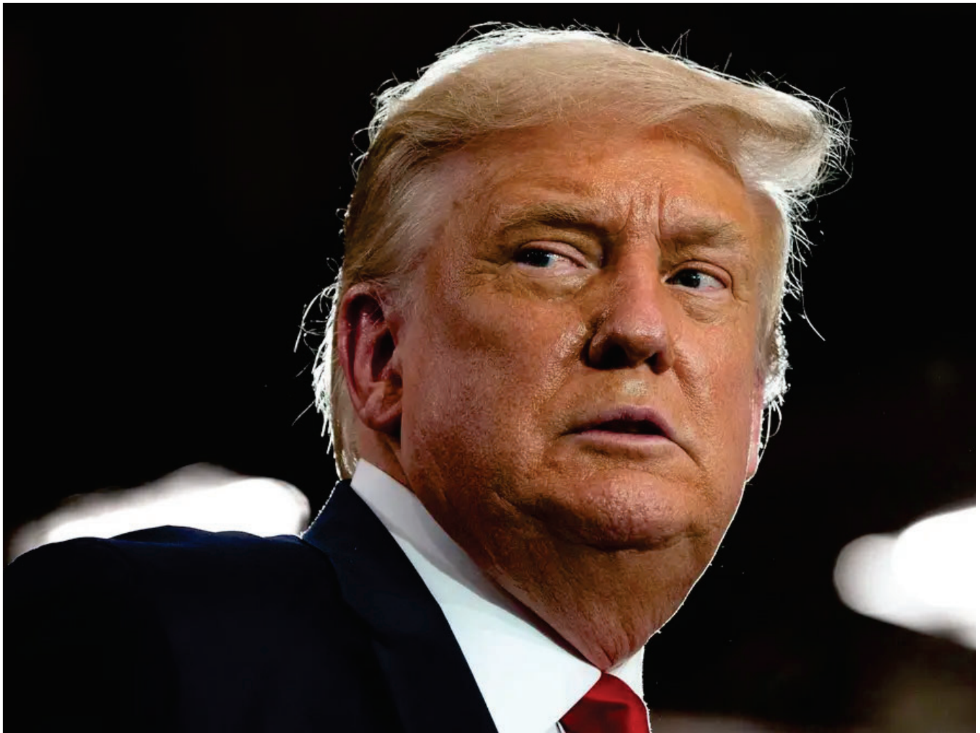
US President Donald Trump speaks after touring the Whirlpool Corporation