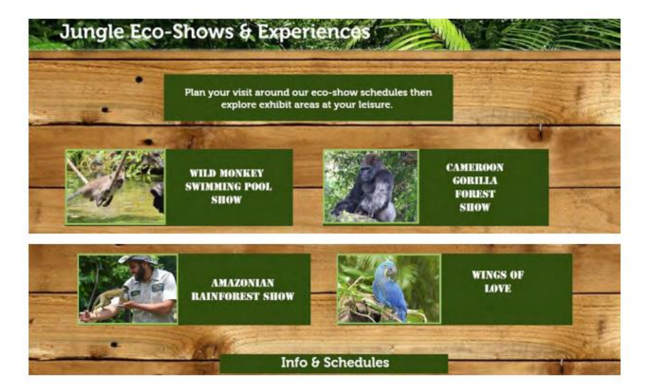
<u>Id.</u> at 341. The "Wild Monkey Swimming Pool Show" is a "natural showcase" in which a "Jungle Guide calls the troop [of monkeys] up from the forest," and "lucky" visitors might "see them skin dive." <u>Id.</u> The "Cameroon Gorilla Forest Show" lets visitors "[e]xperience the wonder of gorillas as our King of the Jungle and your Jungle Guide interact at a distance, showcasing natural behaviors and exercise routines." <u>Id.</u> at 342. In the "Amazonian Rainforest Show," monkeys that live here "roam as they please—and visitors, students, and researchers can observe them behaving as they would in the wild." <u>Id.</u> Monkey Jungle also hosts "Wings of Love Foundation, a non-profit organization that create[s] a sanctuary for captive parrots that are displaced." <u>Id.</u> In addition to attending the jungle-themed shows, visitors may wander through the natural habitats. Id. at 339.

On a daily basis, Monkey Jungle offers scheduled performances of three different shows.