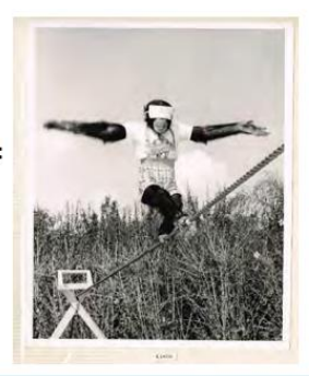
1950's - early 1990's circus show style at Monkey Jungle Theatre: Chimps performing on bikes, tightrope, etc