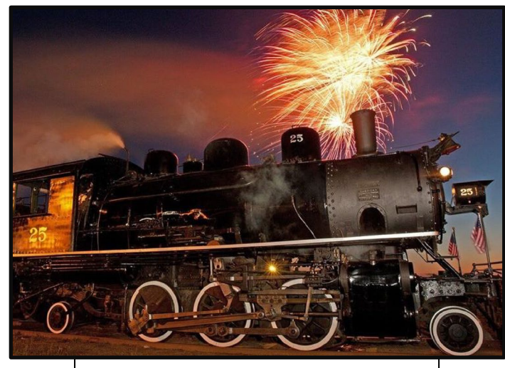
(J.A. Tab 59, DX73-Y.20

Adding to the case's intricacies, OCSR continues to operate along the "abandoned" rail line. OCSR is a nonprofit scenic, passenger train service operating between Tillamook and Enright since 2006. (JSOF at 6). OCSR is a popular seasonal tourist attraction in Oregon, with ridership exceeding 18,000 passengers in 2012 and increasing to 55,000 in 2023. (J.A. Tab 46, JX55.10; Trial Tr. Sumption, at 372:3–10; Trial Tr. Bradley, at 564:17:20, 630:13–21). OCSR's ongoing lease and use of the rail line, along with its positive impact on the local community, demonstrate its value and continued viability. (Trial Tr. Bradley, at 578:20–579:17, 580:16–582:19).