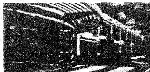
OCWEN CLASS ACTION LAWSUIT

We will contact you if a lawsuit is being considered or has been