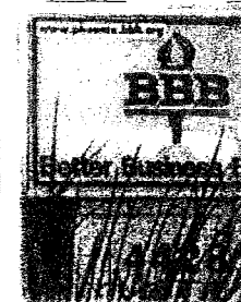
Better Business Bureau Racketeering Enterpr fraud to consumer