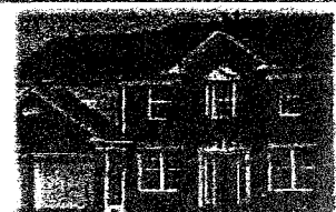
Pulte Homebuilder rip-off Nightmare Homes!