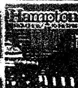
Hampton Virginia police & fire department corruption & racism