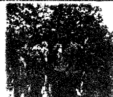
Immigrant workers drop live in make-shift tree h working for $50.00 a w Civil & Human Rights Vic