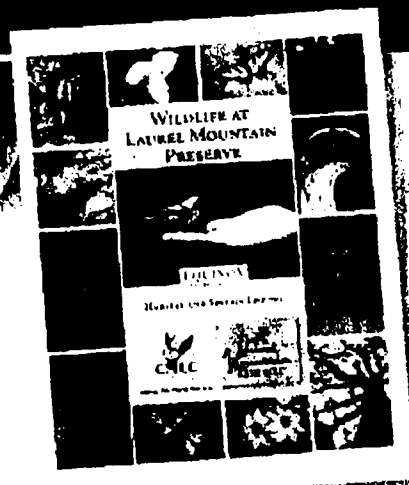
An environmental audit has identified 283 species of birds, animals, wildflowers and other wildlife.

Vistas offer panoramic views of the Blue Ridge and Appalachian Mountains.