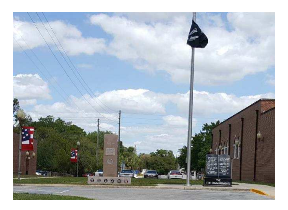
ECF No. 51-3.

The veteran's memorial, flagpole, and Monument can be seen in the following picture (from left to right):