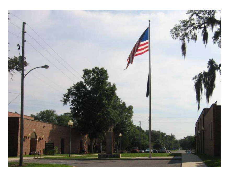
ECF No. 51-1.

Sometime around 1996, a group of donors erected a veterans' memorial in the courtyard between the Levy County complex and the adjacent administrative building. ECF No. 48, at 7. The memorial bears a number of military seals and a block of text stating "IN MEMORY OF THOSE WHO SERVED OUR COUNTRY IN ALL WARS." Id. A flagpole was placed next to the memorial sometime later. Id. A picture of the memorial and flagpole, as they stood in June 2009, can be seen below: