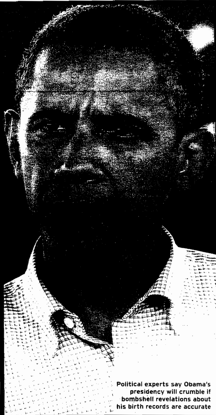
Political experts say Obama's presidency will crumble if bombshell revelations about his birth records are accurate

some people believe it offers more proof that the President was born in his father's African homeland.