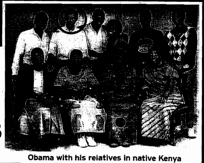
Obama with his relatives in native Kenya