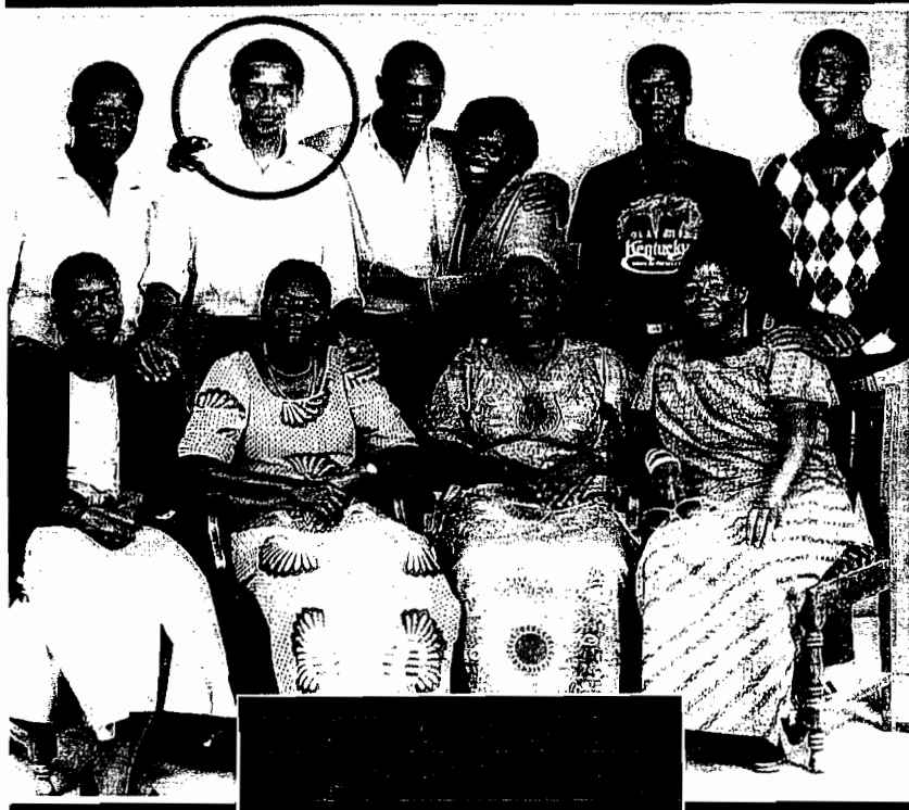
This shocking 1987 photo shows the future President, second from left in the back row, with relatives in Kenya