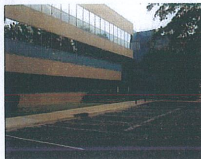
Guardian Digital Forensics Lab - Raleigh, NC

For more information, including our rates, visit our Frequently Asked Questions page or send us a request for more information . If you need immediate assistance call 919-868-6291 anytime.