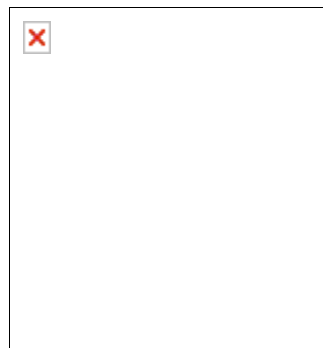
Before Guitar Hero