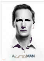
A GIFTED MAN S01E11 IN CASE OF (RE)BIRTH