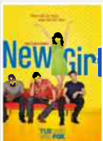
NEW GIRL S01E10 THE STORY OF THE 50