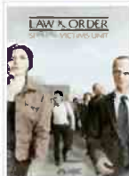
LAW & ORDER: SVU S13E12 OFFICIAL STORY