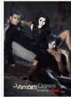
THE VAMPIRE DIARIES S03E12 THE TIES THAT BIND