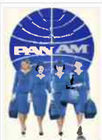
PAN AM S01E11 DIPLOMATIC RELATIONS