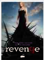
REVENGE S01E13 COMMITMENT