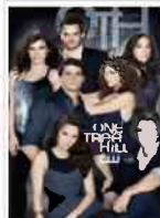
ONE TREE HILL S09E02 IN THE ROOM WHERE YOU SLEEP