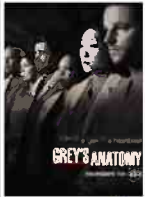
GREY'S ANATOMY S08E12 HOPE FOR THE HOPELESS