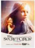
THE SECRET CIRCLE S01E12 WITNESS