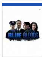
BLUE BLOODS S02E11 THE UNIFORM