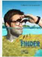
THE FINDER S01E02 BULLETS