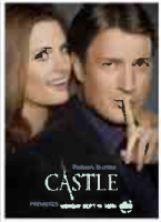
CASTLE S04E12 - "DIAL M FOR MAYOR" PROMO (HD)