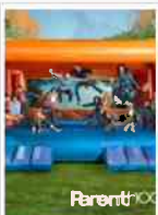
PARENTHOOD S03E14 - IT IS WHAT IT IS