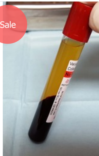
PRF & Phlebotomy Hands on Course in Denver, CO June 2nd, 2018 $950.00 $750.00