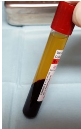
PRF & Phlebotomy Hands on Course in Krakow, Poland- March 11, 2018 $950.00 $250.00