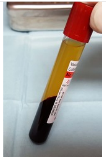
PRF & Phlebotomy Hands on Course in Chicago, IL - February 24, 2018 $950.00 $750.00