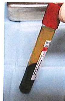
PRF & Phlebotomy Hands on Course in Chicago, IL - February 24, 2018 950.00 $750.00