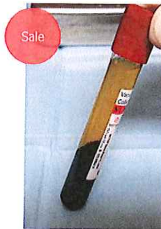
PRF & Phlebotomy Hands on Course in Denver, CO June 2nd, 2018 950.00 $750.00