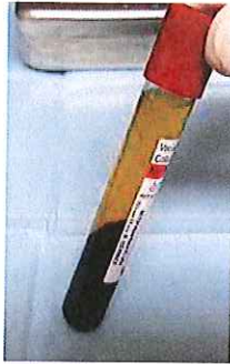
PRF & Phlebotomy Hands on Course in Krakow, Poland- March 11, 2018 950.00 $250.00